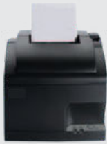
Matrix Printer TSP700