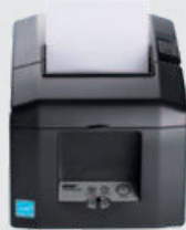
Thermal printer TSP 743