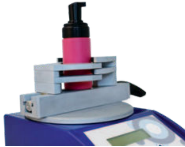
with v-shaped jaws