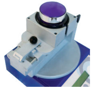
Specific & on-demand